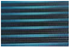
Ripple fin heater technology

EvoHeats exclusive ripple fin heater technology increases condenser surface area by 10-15% producing greater energy collection and higher performance while maintaining a compact design.